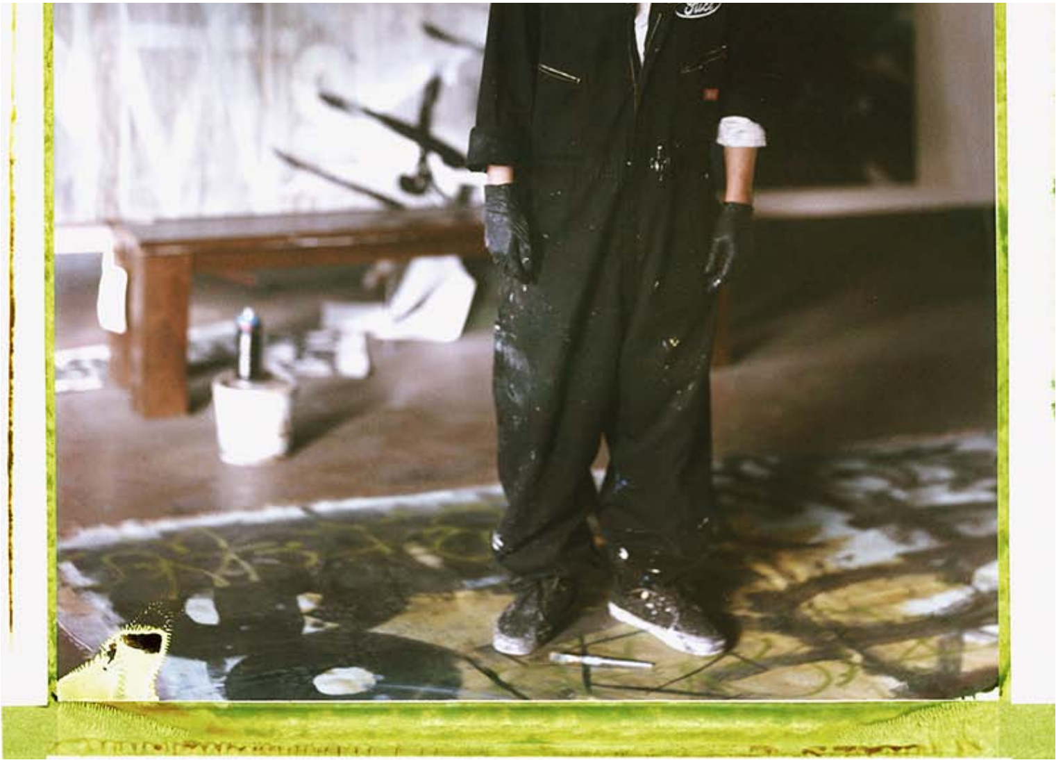
8"x10" Polaroid photo of Prime

Learn more about The Container Yard here .